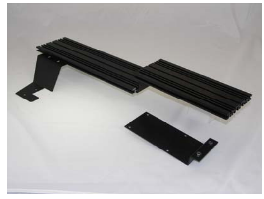
Sub-assemble C-B43 (only the piece shown), 18" portion of trak, extrusion adapter bracket, rear extension bracket and 12" portion of trak